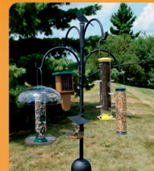
Bird Feeding Stations Start Here