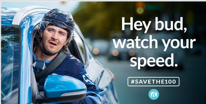
Static Facebook ad.