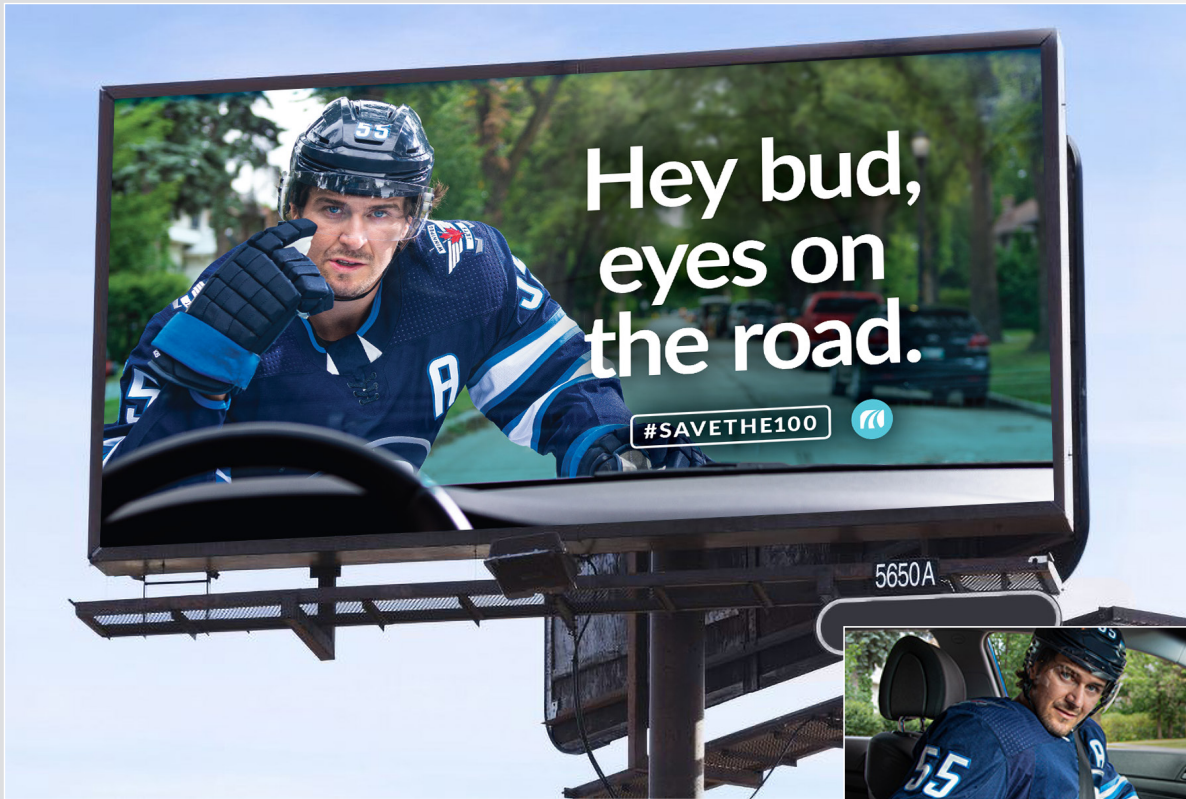
20ft x 10ft billboard