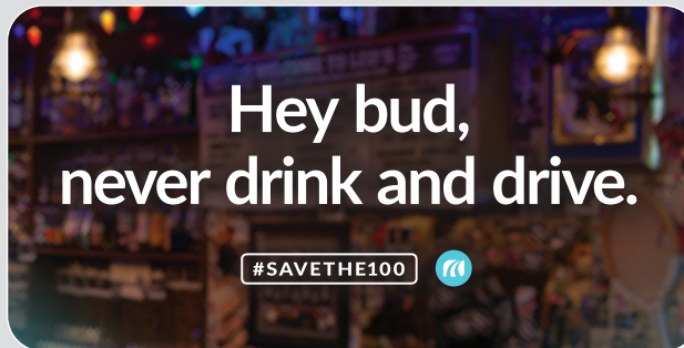
20ft x 10ft side-by-side billboards

Campaign over $50k: Be a team player for road safety