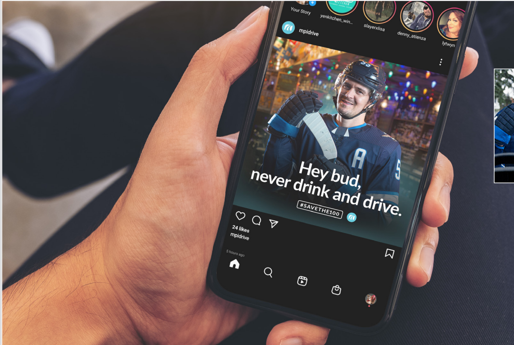
Static Instagram ad