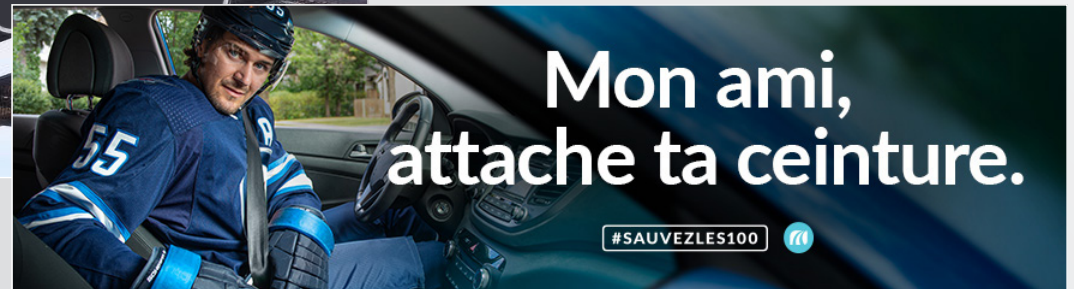
14ft x 48ft digital billboard