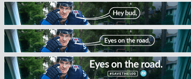
Animated online display ad - "leaderboard" (728 x 90 px)