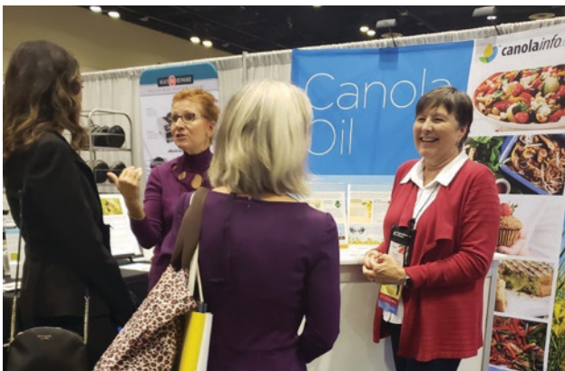
CanolaInfo dispelled misinformation while exhibiting at the Food & Nutrition Conference and Expo. The event attracted commodity groups, health associations, consumer packaged good companies and food service suppliers.

With partners like the American Heart Association, CanolaInfo continued to monitor important food industry topics and share canola information with credible influencers in the health, nutrition and food sectors. Activities in 2022 included participating in the American Heart Association's Industry Nutrition Forum for food industry leaders and nutrition scientists, and co-hosting a Facebook Live event on canola oil for 100 health professionals in partnership with the Association of Nutrition Schools in Mexico.